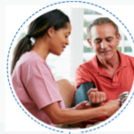
2 Year College